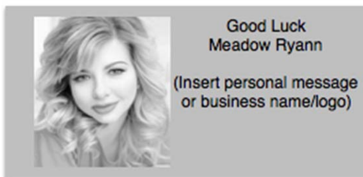
Sample Business Card Page Ad (1/2" margins)